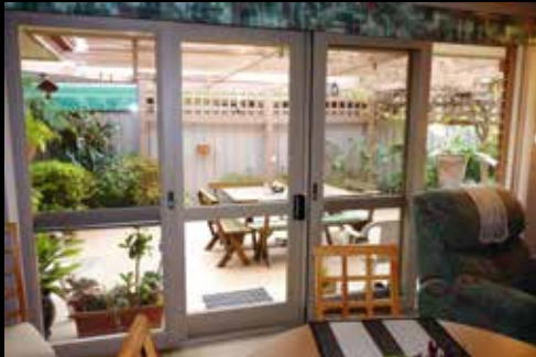
HAHNDORF, 6 Valma Avenue