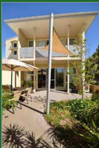
1 Manna Gum Avenue, HAYBOROUGH $620,000

When purchasing a home or land within an EnviroDevelopment you need to know that you will be living in a community with minimal impact on the environment, one that encourages safe, healthy and active lifestyles and results in lower household energy and water costs.