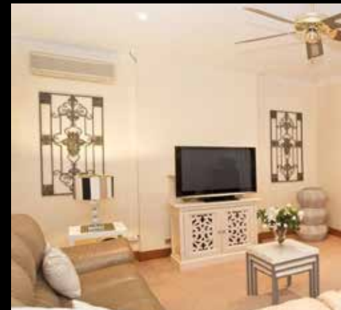
HAHNDORF, 2301 Mount Barker

Never hear quiet, ocean flash space Lifestyle liv