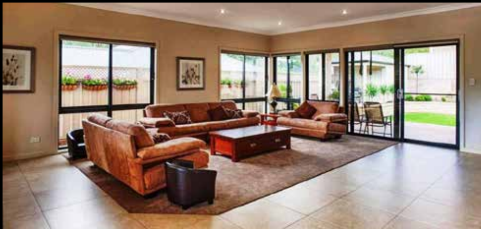
MOUNT BARKER, Childs Road