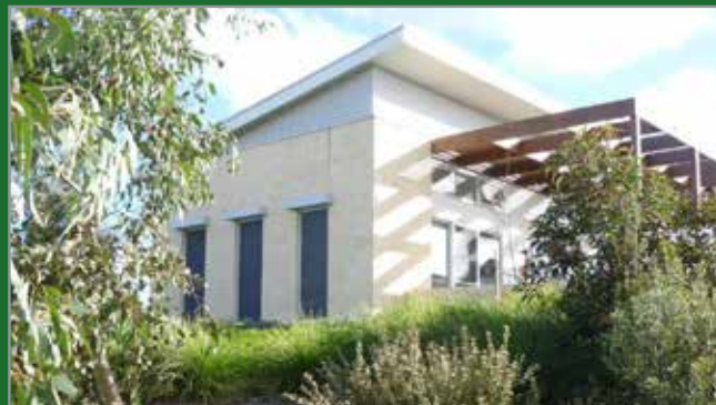
1 Musk Duck Drive, HAYBOROUGH $549,000

Located in the exclusive “Beyond Today” Estate certified EnviroDevelopment, only 400m using walking trails to the beach and 5-10 minutes drive to cafes and restaurants in Port Elliot, the 3 bedroom 2 bathroom contemporary home is designed to maximise energy and water efficiency. Correctly orientated to ensure best access to winter sunlight in living rooms and capture summer sea breeze by good cross ventilation.