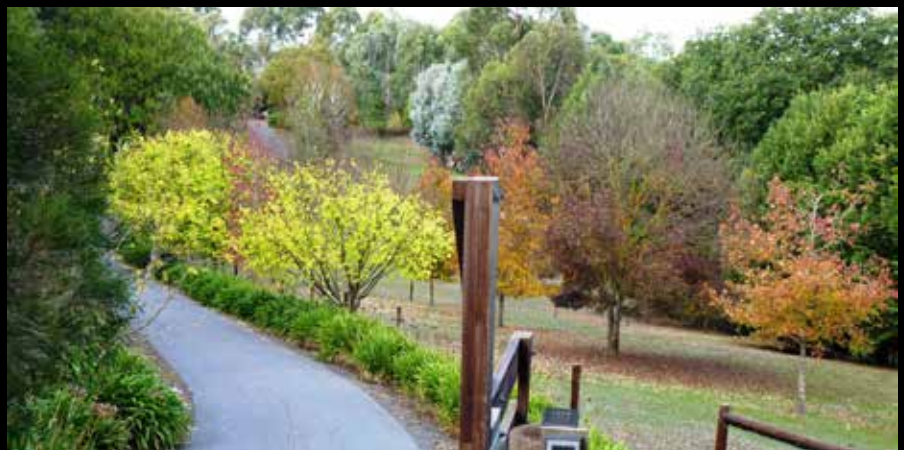
HAHNDORF, 2301 Mount Barker Road

ng throughout SA attracting clients WORLD WIDE!