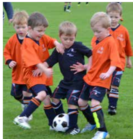
Above: These guys are having a great time at Port Elliot playing in the under-6s. For the record the blue team, the Lions, beat the Sharks, but this competition is all about having fun.