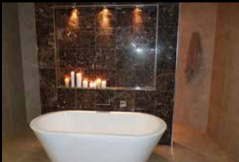
MOUNT BARKER, Childs Road