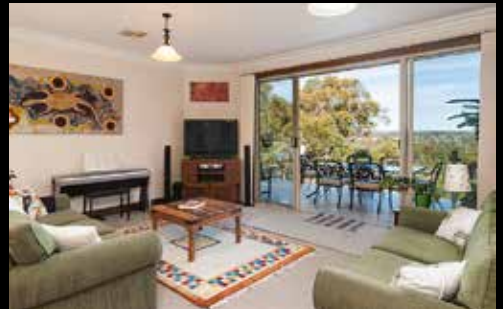
MYLOR, 80 Hampton Road