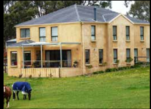
HAHNDORF, 169 River Road