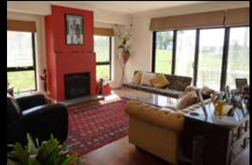
HAHNDORF, 169 River Road