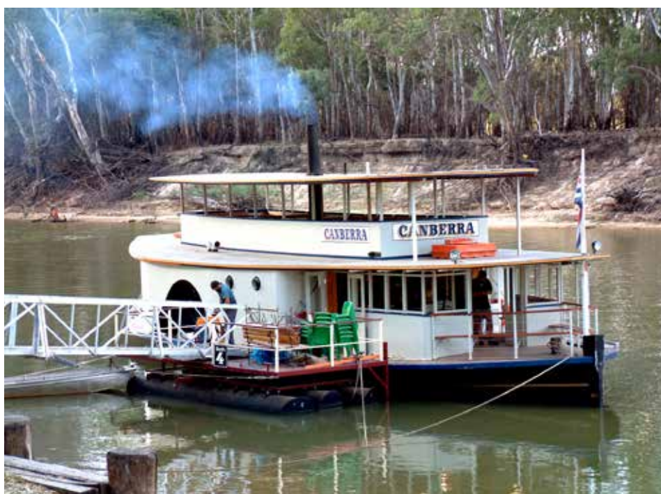
PS Canberra, the last paddle steamer built at the River Port of Goolwa.