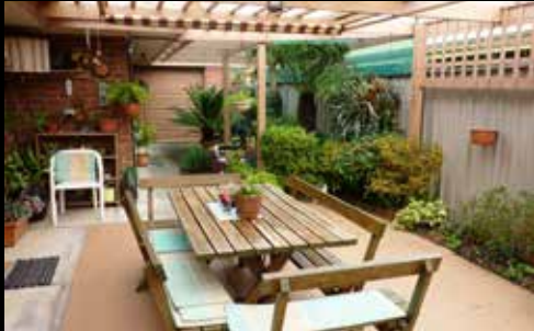
HAHNDORF, 6 valma Avenue